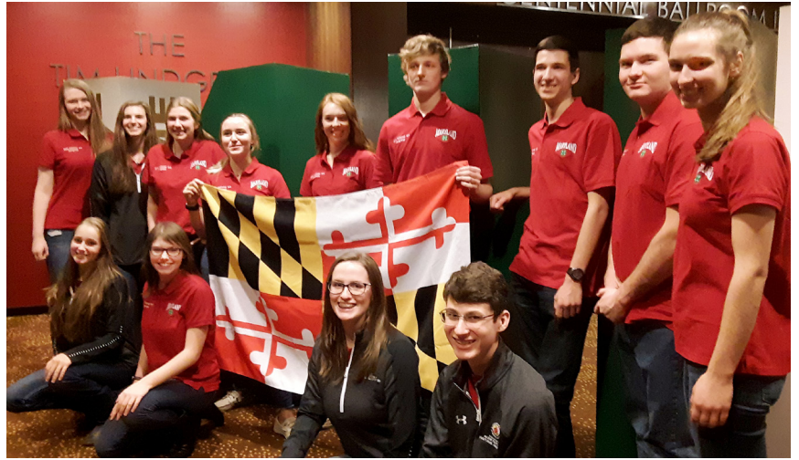
Photo: 2019 Maryland 4-H Delegation to National 4-H Congress.

If an individual declines their first trip offer, there is no guarantee they will receive a second trip offer for that same year.