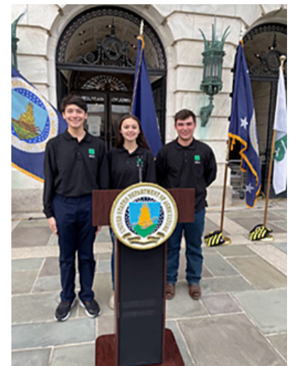
Photo: 2022 Maryland 4-H Delegation to National 4-H Conference.

For additional information about each trip opportunity please see our National 4-H Leadership Links .