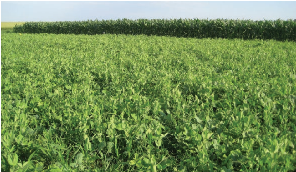
Incentive payments offered through NRCS are higher when planting a multi-species cover crop mix. The mix in this field includes oats, proso millet, canola, sunflowers, dry peas, soybeans and pasja turnips.

but as long as guidelines are met, generally a majority of applications are approved. As stated previously, these incentive payments should be viewed in the context of providing transition support rather than as a long-term economic subsidy.