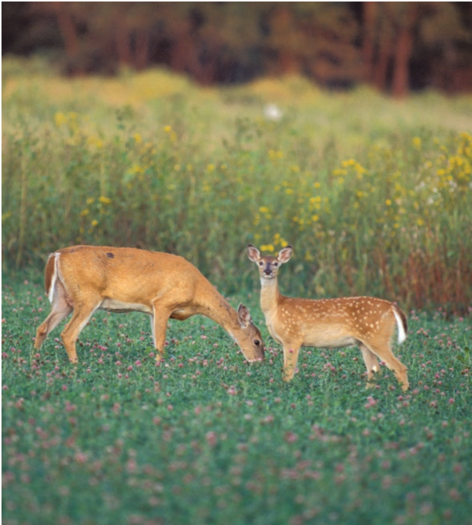
Cover crops can represent a recreation opportunity by helping to provide year-round food and habitat for wildlife such as deer.

the field and the less total risk of erosion. Eroded soil particles carry sediment with them into waterways.