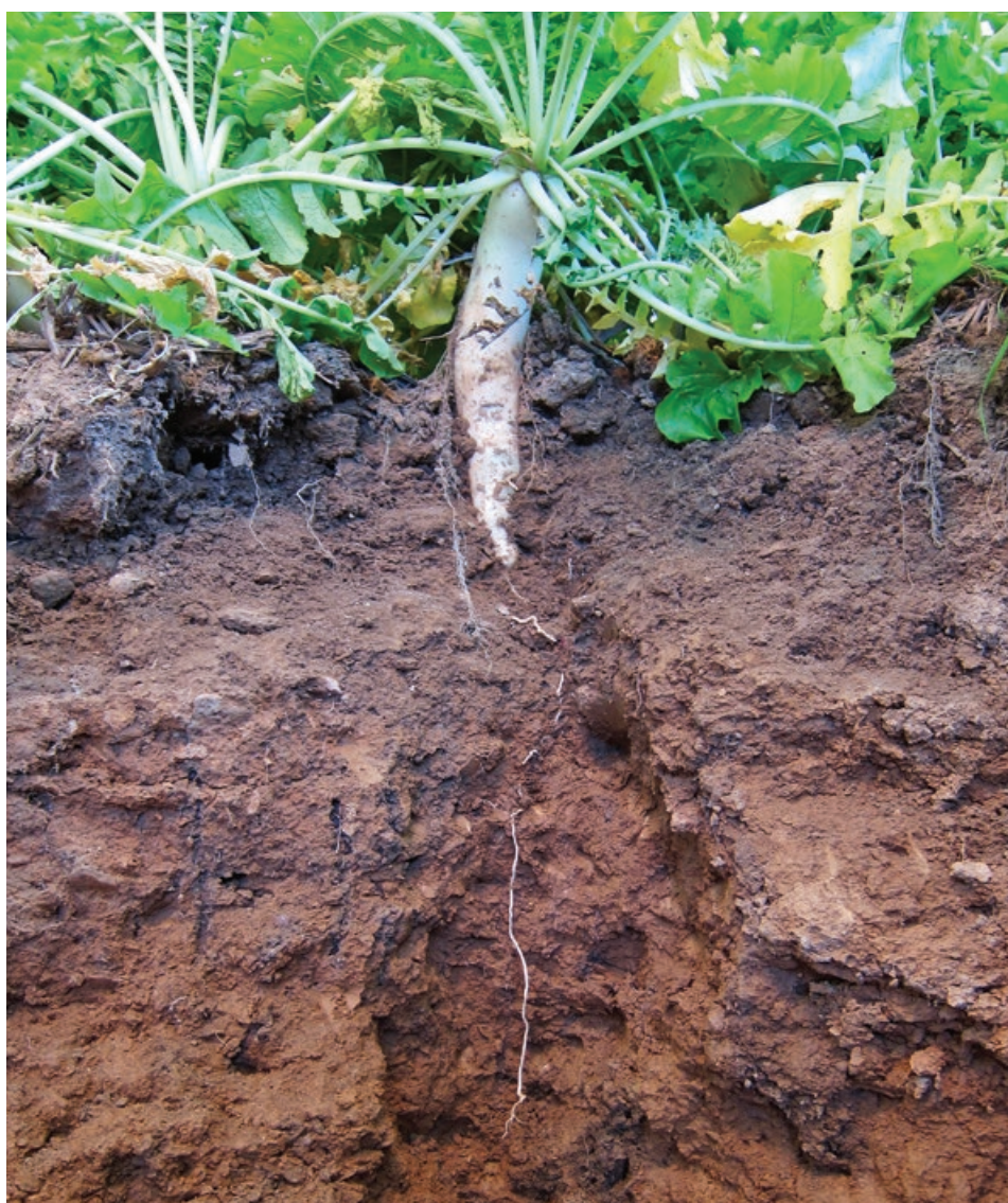
Cover crops that can root deeply, such as radishes, can help alleviate soil compaction.

While the triggering effect cover crops have on reducing tillage is notable, what is more important economically is that cover crops seem to ease the transition to no-till. Farmers have been advised for decades that they can expect an initial yield dip when changing to no-till but that if they stick