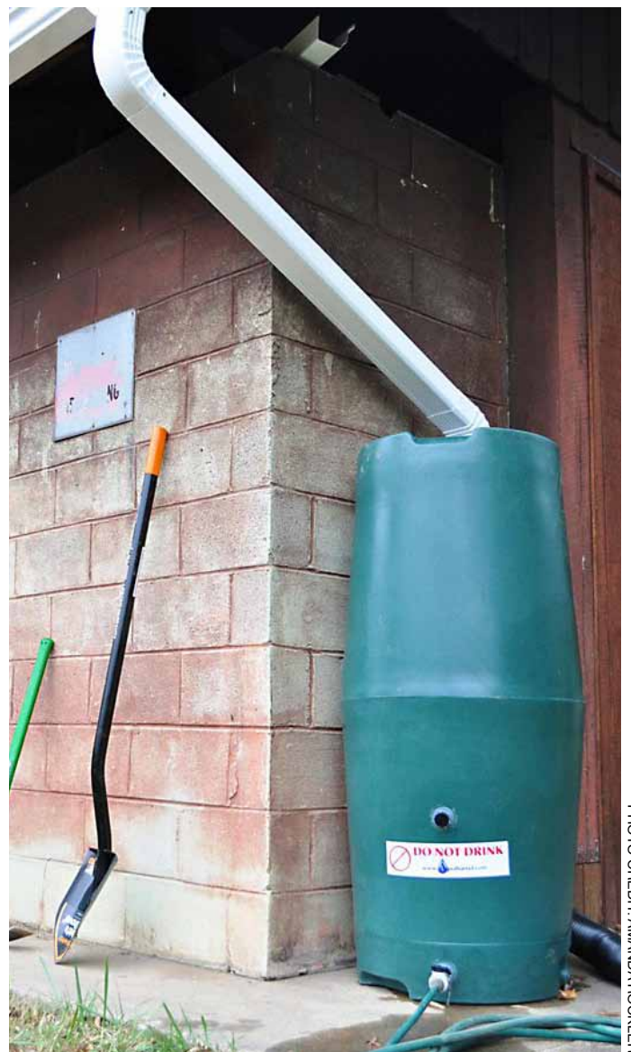
Rain barrels conserve water by collecting rain water from roofs. Rain barrels can then be used for watering gardens and washing cars.

Environmental attitudes are also highly related to the awareness and adoption rates. Environmental attitudes were measured based on household responses to provide ratings to two