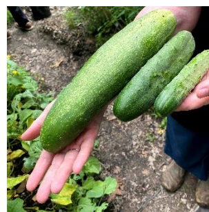
Photos above left-right: Herbs, Swedish Pickled Cucumbers in jar, Lemon cucumbers, and Japanese Climbing cucumbers. Below: All things zucchini.

Next, I had fun making Swedish Pickled Cucumbers . We had 2 Japanese Climbing cucumber plants and 2 Lemon cucumber plants and they gave us plenty of cucumbers. I used both to make Swedish Pickled Cucumbers which were great for a snack or to eat for breakfast.