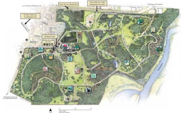
MAP OF ARBORETUM GROUNDS

The National Arboretum is located at 3501 New York Avenue NE and is open every day except Christmas Day. The grounds are open from 8am to 5pm and the Bonsai Museum is open 10am to 4pm except for federal holidays. There is no admission fee. For those of you who are tech savvy, they have a USNA app with information for special tours and to locate and identify many of the plants. I like to just roam around since there is always something interesting to see. It is a garden, so wear your walking shoes!