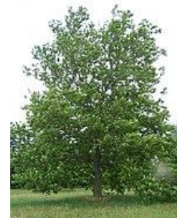
L-R: Buttonbush, bark of Persimmon, leaf of Northern Red Oak, and a young Sycamore tree. Photos from Wikipedia.