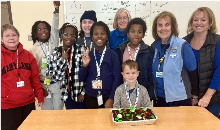
One of our Junior Master Gardener classes. Join the fun!

Pre-Conference Virtual Orientation: Feb 15, 2024, 5pm EST