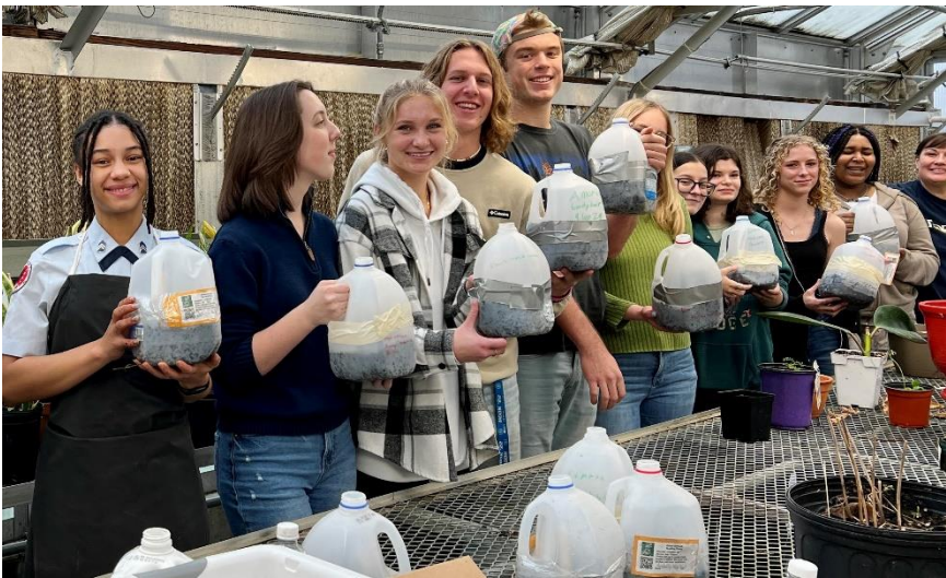
Left: Students at Forrest Careers and Technology Center learned the techniques of winter sowing to grow seedlings for campus gardens.