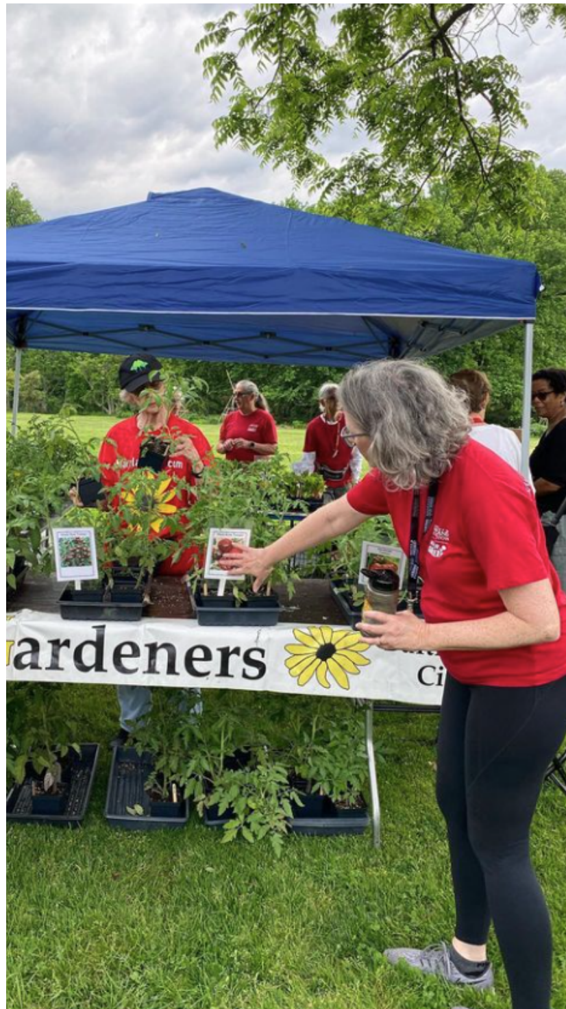
UME Baltimore City Master Gardener volunteers setting up for Market Day at Clyburn Arboretum.

The Baltimore City Master Gardeners volunteered 5,398.10 hours. A volunteer's estimated hourly cost is $28.54. In 2022, the BCMG did $154,061.77 worth of service to Baltimore City.