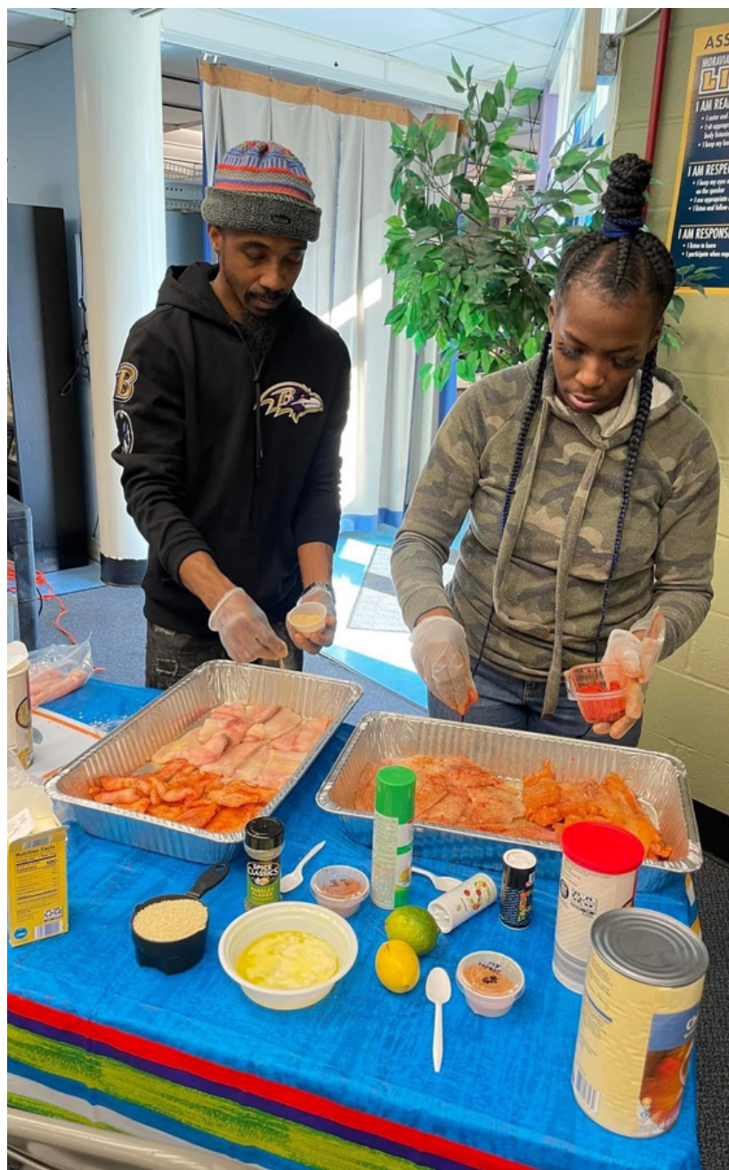
Maryland Snap-Ed participants learn healthy cooking methods through hands-on food preparation lessons and smart shopping tips to create healthy, affordable meals for their families. Participants (shown above).

SNAP-Ed connects local producers and farmers' markets with low-income Marylanders to increase access to locally grown fruits and vegetables.