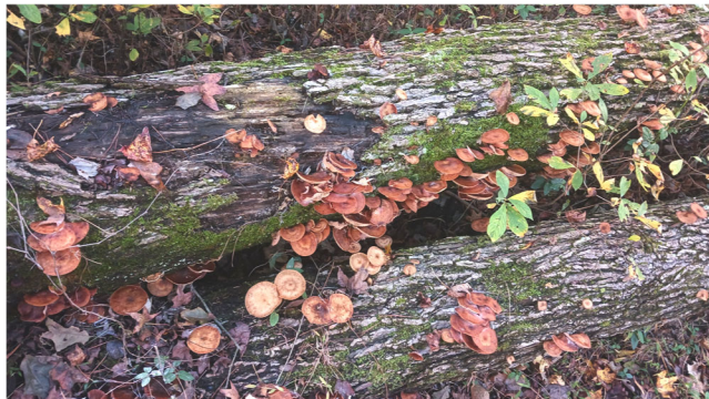
Armillaria commonly known as black shoestring fungus severed the roots of this tree that fell down from the wind. The fungus then eats the dead tree. Mushroom fruiting bodies spread spores to infect other trees.

Tree damage can occur naturally as the trees grow and mature in the forest or unnaturally as a result of damage during a harvest or other human activities. It is important for you as a logger to ensure that your equipment does not unintentionally damage trees that will be left standing to grow in the harvest area. Trees