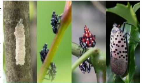
Left to right: Abbreviated lifecycle of SLF, from eggs, first and second instars, to adult.

The invasive planthopper, spotted lanternfly, Lycorma delicatula , has been identified across Maryland. The Maryland Secretary of Agriculture has issued a quarantine order for 18 Maryland counties . All counties in Delaware are also under quarantine. Businesses and institutions are required to be permitted if they move regulated articles from or within the quarantined area. The regulated articles include forest products such as logs, mulch, stumps, chips, among others, but also applies to equipment and trailers. For more information, go to https://mda.maryland.gov/plants-pests/pages/spotted-lantern-fly.aspx or click the QR code on this page. This quarantine order applies to all loggers operating, harvesting and/or traveling in or through quarantine areas in Maryland and Delaware.