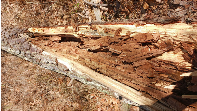
Wind brought down this living pitch pine infected with a brown rot fungus in the heartwood. Note the blocky red characteristic.

Fungi are the leading cause of wood deterioration. As a society, we spend countless dollars to protect and preserve wood and prevent fungi from finding another food source.