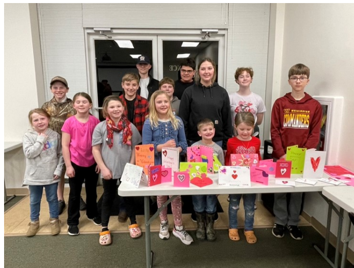
Members with valentine's cards we made at meeting