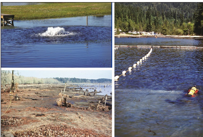
Figure 12. Cultural control methods. Upper left: aerator. Lower left: drawdown. Right: benthic barrier being deployed.

Cultural and physical control methods (Fig. 12) can sometimes be used if they are appropriate for your situation. For example, some populations of algae can be reduced by aerating the pond (introducing oxygen to the bottom of the water column), adding alum to inactivate phosphorus in the water column, or using dyes or pond covers to reduce light penetration. However, these methods are most effective before serious algae blooms occur and have limited use once algae has taken over a pond. Submersed weeds can be managed by installing benthic barriers, which smother the weeds; these can be made from durable materials such as vinyl or plastic or from biodegradable materials such as burlap. Submersed weeds also can be controlled by lowering the water level (drawdown) and allowing the bottom sediments to dry out for several months. Although useful, benthic bar-