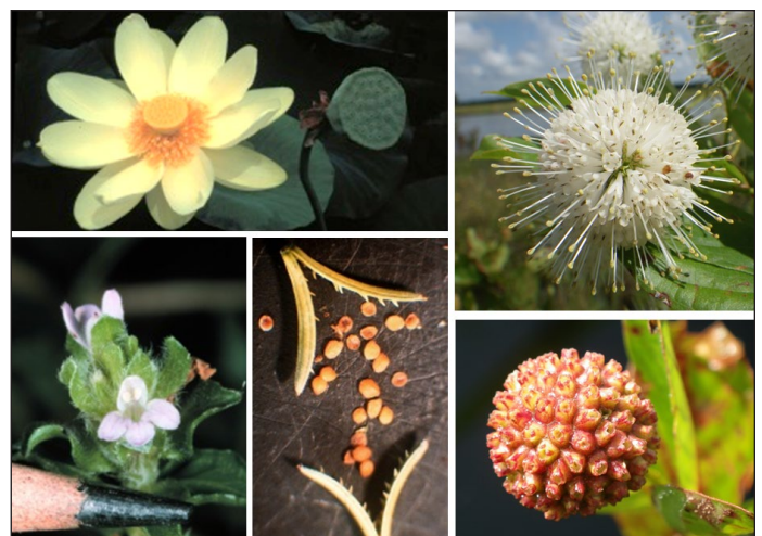
Figure 11. Reproductive structures. Clockwise from upper left: flower and unripe seed pod; inflorescence; ripe seeds; capsule with seeds; flower size and position.

If possible, collect and press a specimen for reference. If the species has not been found in your area before, your local herbarium may ask you to submit a dried sample so they can voucher the plant and have a record of its presence.