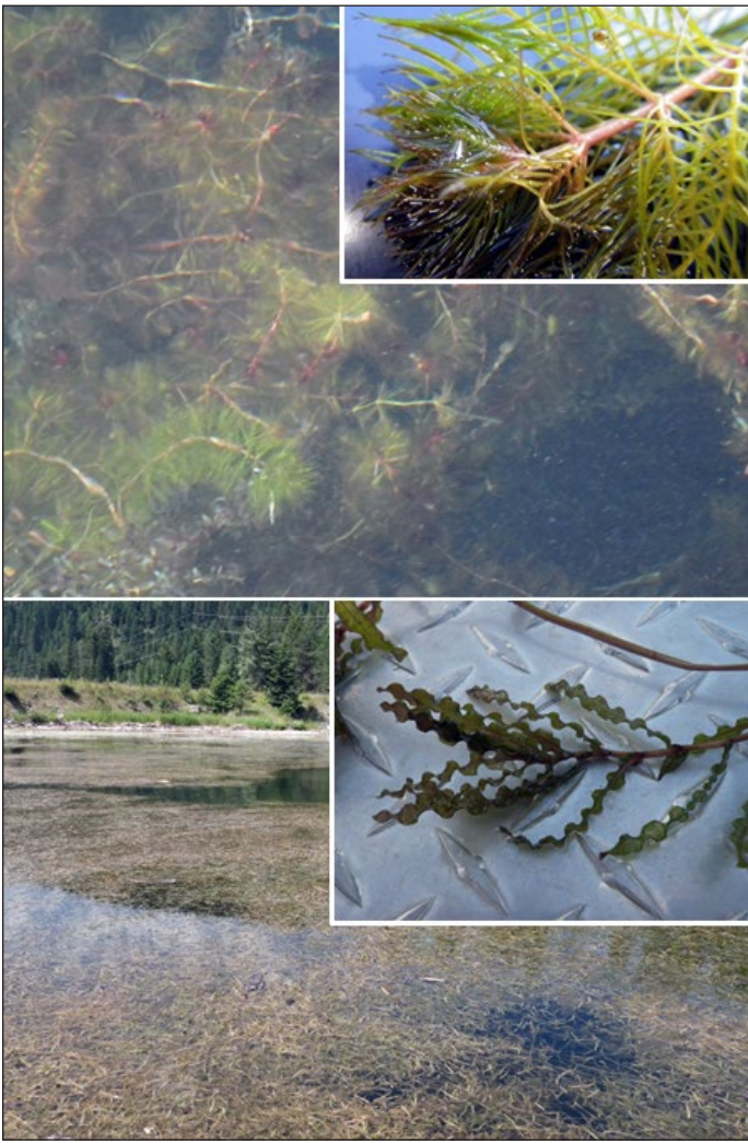
Figure 9. Invasive submersed plants. Upper: Eurasian watermilfoil. Lower: curlyleaf pondweed.

tion digital photographs of the plant to your aquaculture or fisheries specialist or other trained individual (do not send live or pressed specimens unless the identifier requests them). Be sure to provide good, clear, in-focus images that will be useful for identification. Your photo collection should include a shot of the habitat where the plant occurs (from a distance to show scale and close up to show detail) and a portrait of the entire plant, both submersed and emergent plant parts. More detailed images are useful as well. Use a solid background (white, black, or gray) as a backdrop for detailed images. Place a ruler, pencil, or other object of known size in the frame to show size or scale. Detailed images should include: