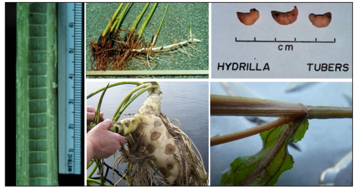
Figure 10. Vegetative plant parts. Clockwise from left: cut stem showing interior structure; runners and roots; tubers; leaf attachment and arrangement; rhizome.

region where the leaf attaches to the stem—common in grasses) if present.