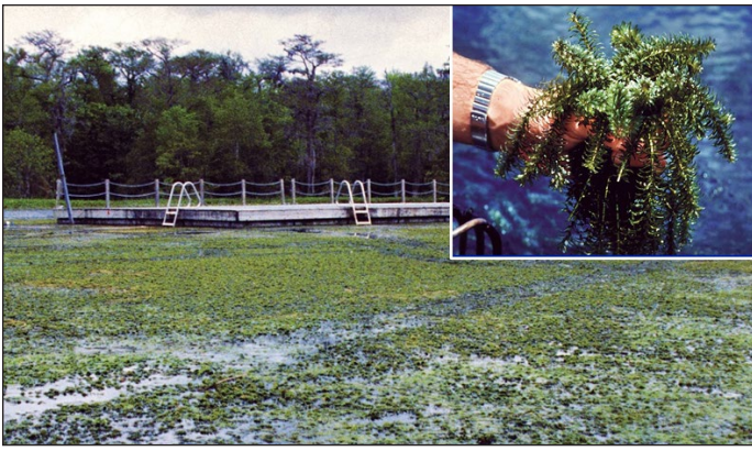
Figure 2. Hydrilla was introduced to the U.S. via the aquarium industry and is one of the world's worst weeds.

ium plant dealers cultivated hydrilla in canals and waters near their nurseries to have easy access to plant material for their customers. Hydrilla is constantly being re-introduced as contaminated boat trailers are moved from one body of water to another and as hobbyists dispose of extra aquarium plants by dumping them in the nearest body of water. Hydrilla can produce roots and new plants from extremely small fragments, so other vectors for introduction include birds and other wildlife and recreational equipment such as boats, jetskis, and trailers. This noxious weed causes a number of problems in aquatic ecosystems; it crowds out native plants to form monocultures, which are poor habitat for aquatic wildlife and fish. Dense plant growth also traps heat, which increases the temperature of surface water and depletes dissolved oxygen, resulting in conditions that can harm fish. Hydrilla also obstructs water flow, which can clog irrigation systems and cause flooding during tropical storms, hurricanes, and other severe weather. Hydrilla hinders the recreational uses of water as well. Outboard boat motors quickly become clogged and strangled with weeds; fishing lines are snagged within moments of being cast; and swimmers have reportedly drowned after becoming entangled in hydrilla.