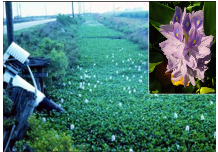
Figure 1. Water hyacinth was introduced to the U.S. in the 1880s and is one of the world's worst weeds.

Many aquatic weed problems in the U.S. are the result of intentional introduction. For example, the floating weed water hyacinth was reportedly introduced in the U.S. at the Southern States Cotton Expo in New Orleans in the 1880s, where visitors were given water hyacinth plants as souvenirs. Local legend states that a Florida resident brought plants back to his water garden near the