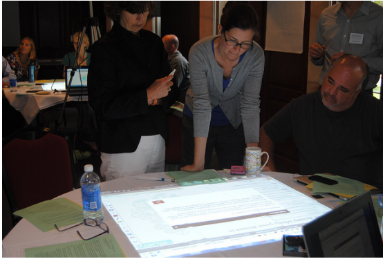
The weTable, based around the popular Nintendo Wii gaming platform, provides opportunities for individuals and organizations to share data, seek input, and support informed decision-making.

laptop using a Bluetooth connection. Participants share control of the projected screen by passing the pen, marking up images of maps, adding comments, and modeling scenarios on the table with a click of the pen.