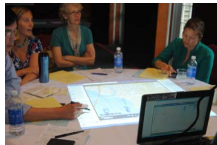
Workshop attendees at the University of Maryland learn to engage and facilitate meetings using the weTable.

Affordable...Engaging...Easy...Collaborative...Fun mounting the projector on a tripod, the weTable technology allows the computer screen to be projected onto virtually any surface with participants interacting with the table, wall, or floor using a “light” pen as one uses a computer mouse. A Nintendo Wii Remote™ (Wiimote) communicates the pen’s location to the