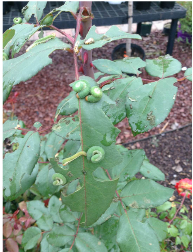
Curled roseslug sawfly larvae are still feeding at this time of year.

Kleason Martin, Sunny Meadows Garden Center, found curled roseslug sawflies on roses this week. Bristly roseslug sawfly is another species that is active through the growing season. Both species overwinter in the pupal stage. Spinosad, Mainspring, Acelepyrn, and horticultural oil are all good control options.