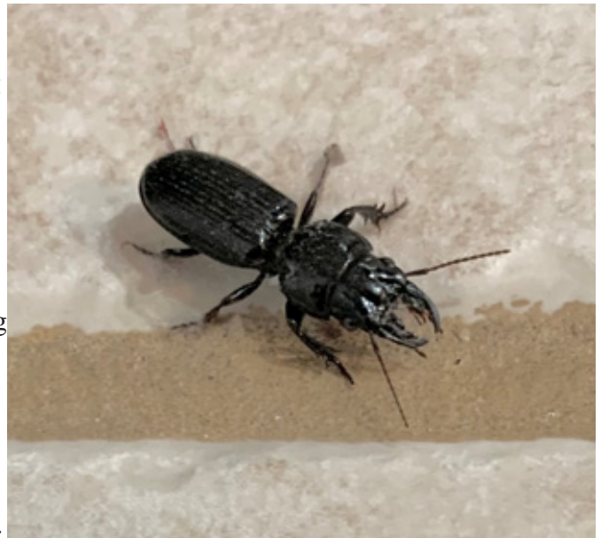
Big-headed ground beetle ( Scarites subterraneus ) adults feed on a diversity of other insects, snails, and slugs, and some plant material providing biological control services.

Because ground beetles are good biological control agents of potential pest insects and weeds, and they have diverse diet preferences, a number of studies have examined methods to enhance ground beetle populations by modifying managed environments to be more favorable for ground beetles – an approach referred to as conservation biological control. Studies have shown that installing “beetle banks” (rows of bunch type grasses between crop rows) in agricultural fields enhances populations of ground beetles, with the grasses providing refuge and overwintering habitat. Production nurseries often install grass allies between plant rows, which should favor ground beetles. Container plant producers can put hard wood mulch over weed cloth beds. Our research has shown that this will increase prey item abundance (ex. collembola breaking down the mulch), provide habitat (nooks and crannies from the mulch) and increase ground beetle activity. It would be hard to go wrong trying to encourage a diverse and abundant population of ground beetles with their potential for providing pest insect and weed suppression. These practices will also increase the abundance and diversity of numerous natural enemies, especially those that are generalist feeders.