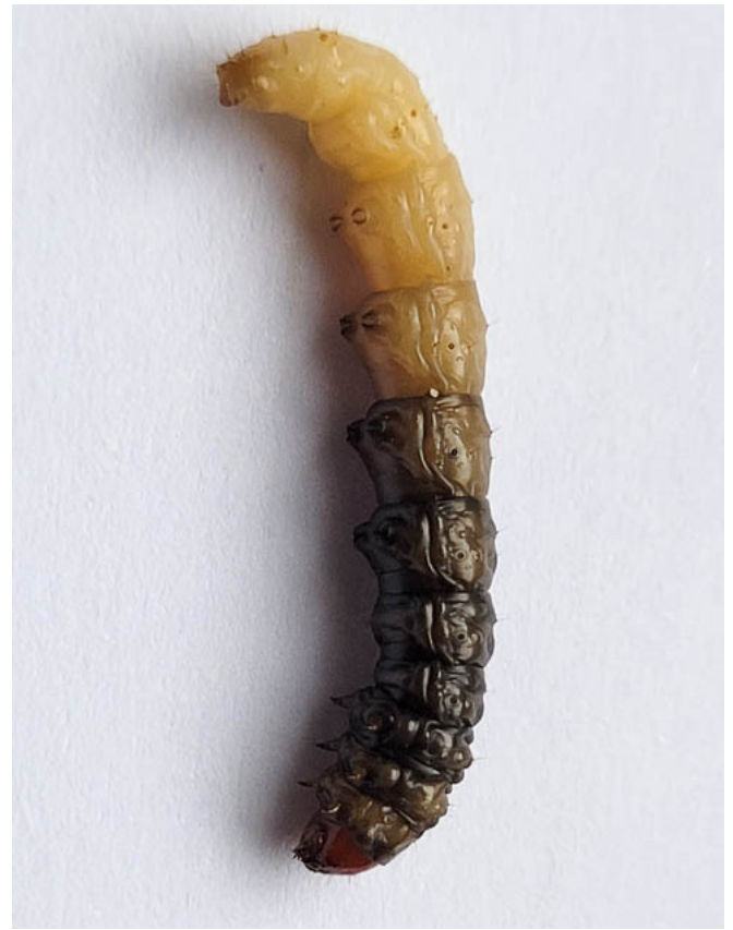
A lilac borer larva was extracted from the tree.