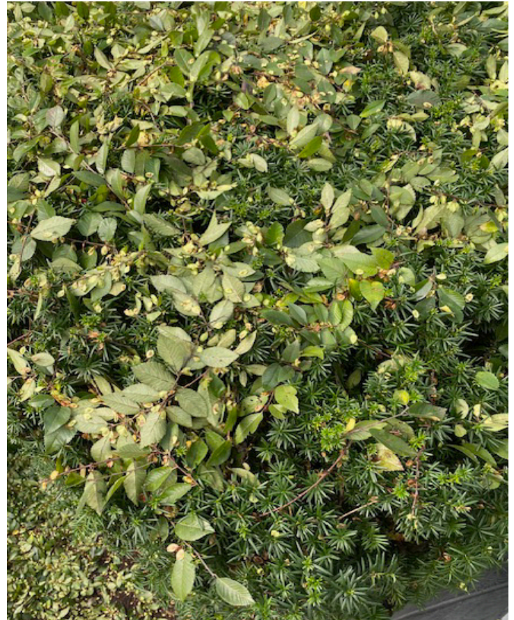
Extensive damage and debris on a Chinese elm from squirrels clipping branch tips.