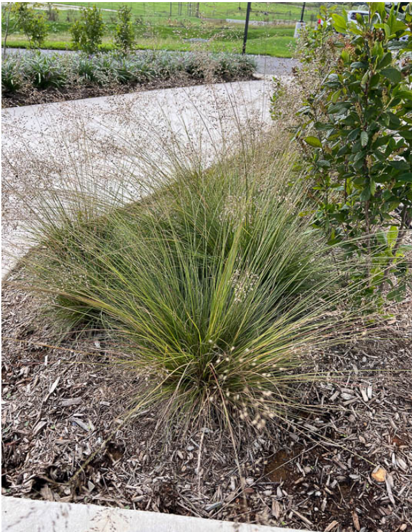
Prairie dropseed provides four seasons of interest in the landscape.

slender stems that rise above the foliage, and when mature become tiny rounded seeds that drop to the soil from their hulls. Plants can provide four seasons of interest. After mowing down the foliage in the spring, the new growth has decorative arching stems; in summer, the green mounds need no maintenance; in the autumn, the foliage turns to gold with airy seed heads dancing in the breezes, and winter brings a sturdy bronze colored mound of grass that even snow can not beat down. Birds enjoy the seeds and the plants are tolerant of drought, erosion, deer, air pollution and black walnut trees.