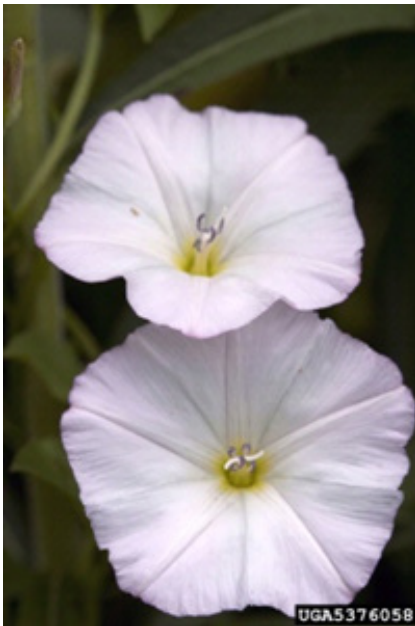
Figure 2. Field bindweed's flowers.

Mechanical control of field bindweed is difficult due to the rhizomes and low growth habit. In some studies it has been shown the regular cultivation, up to 25 times in a growing season, can be helpful in stopping field bindweed from development. Less rigorous cultivation can actually help spread the plant as breaking the roots acts as one method of spread. Freezing and thawing of the soil helps to break seed dormancy. Seeds can remain viable for up to 30 years. Burying the seed to depth of greater than 12 inches prevents germination, but only until brought to the surface later. Herbicides for suppression include glyphosate, and 2,4-D products depending on location. Neither chemical application is considered a single application control method. Timing of applications should be mid to late summer and early fall, with close monitoring of the site for return growth. Care needs to be used with the use of these products to prevent damage to the desired species of plants in the landscape near this weed.