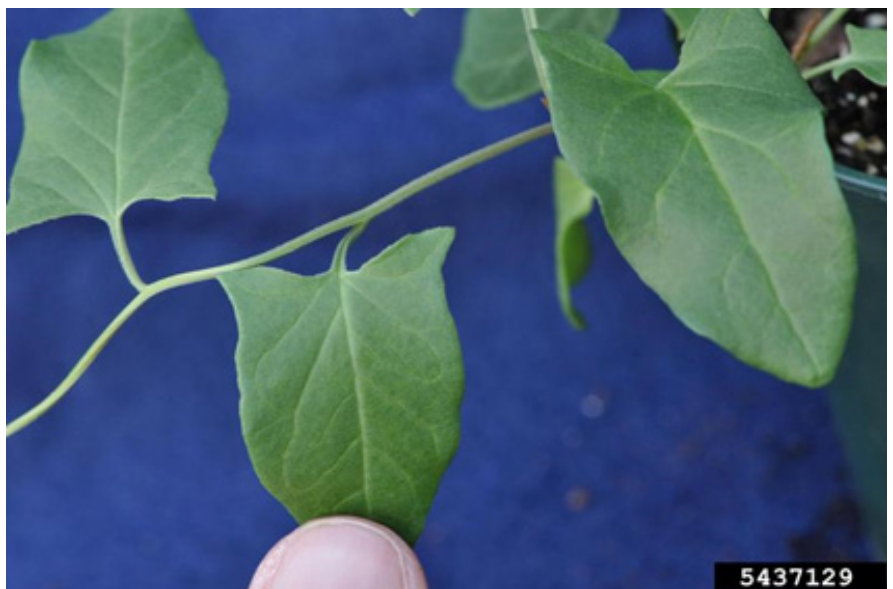
Figure 1. Field bindweed leaves.

Field bindweed ( Convolvulus arvensis ) is a perennial plant which reproduces from seed or rhizomes. A native of Europe, it is now found worldwide. The plant has bell-shaped leaves (Figure 1) and produces a white flower (Figure 2). On rare occasions, it may have a pink flower. This weed can produce stems that can grow several feet in length growing horizontally or climbing into and covering shrubs and trees. A new plant can produce roots that can grow downward to five feet in the first year and have a circumference of ten feet. Over time this plant, soil type-dependent, can sink roots to greater than fifteen feet (some reports of up to thirty feet) where it is stealing both moisture and nutrients from desired species of plant material.