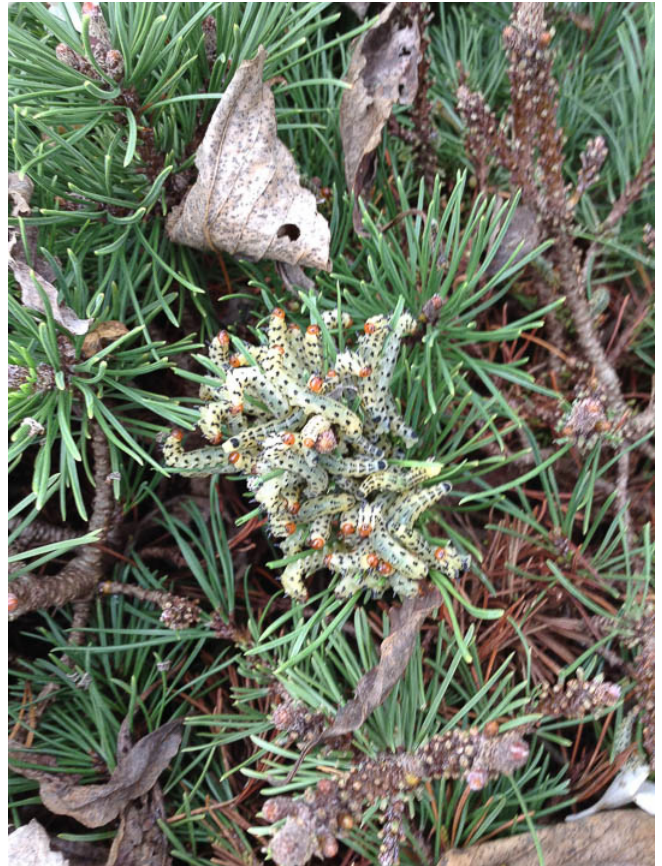
Redheaded pine sawfly can cause significant damage.

Control: Prune off tip growth on which they are feeding and destroy. Conserve insecticide will also give control.