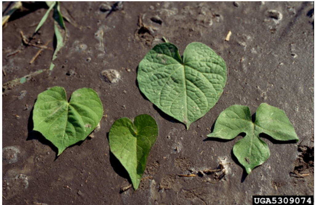
Figure 3. Leaves of various morningglory species; From Left to Right: red ( Ipomoea coccinea ), pitted ( Ipomoea lacunosa ), entireleaf ( Ipomoea hederacea var. integriuscula ), and ivyleaf ( Ipomoea hederacea ).