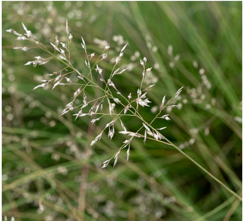
Close-up of the seed head that will be present in the fall.