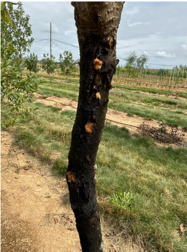
Frass coming out of the trunk of a fringetree indicates a possible borer problem.