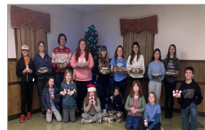
Kaleidoscope Members at the December meeting with the craft and cookie donations