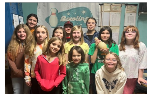
Kaleidoscope Members at the bowling alley