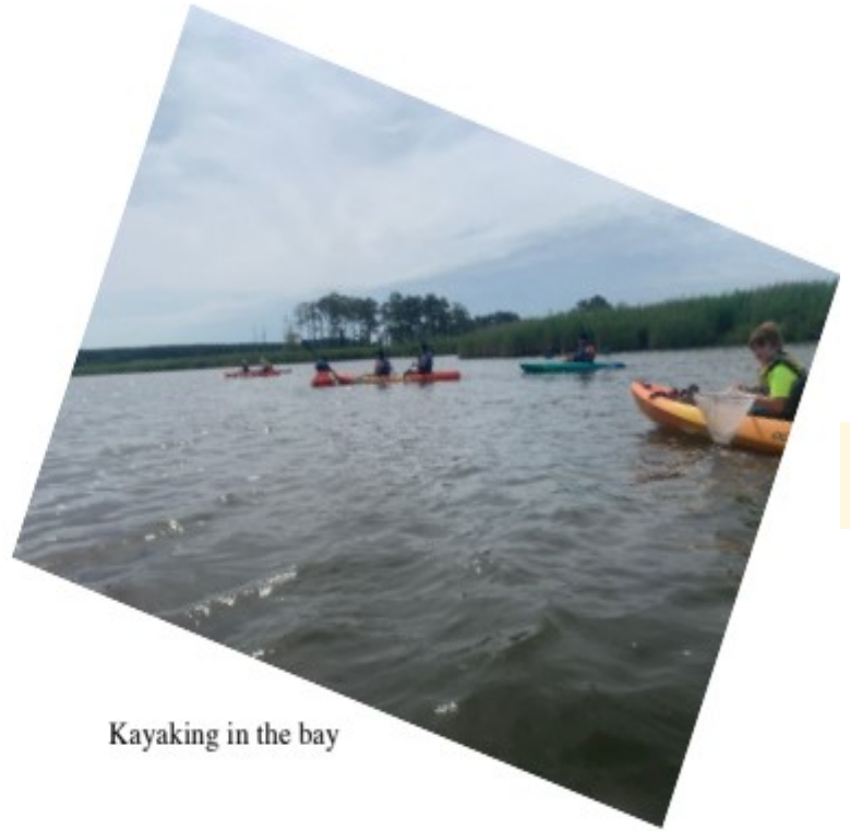
Kayaking in the bay

On a beautiful day in mid July the Frederick 4H Naturalist club did our first annual field trip to Maryland's coastal Chesapeake Bay ecosystem. We kayaked with the Chesapeake Bay Environmental Center (CBEC) staff on a tour around a nearby Bay called Marshy Creek. The mission of the CBEC is to connect people to nature through adventure based learning, and so our tour led us out into the bay where we saw great stands of an invasive grass called Phragmites (Common Reed) that covers all of the marshland around. It grows very tall and dense so that native shoreplants and other organisms don't have room to survive and thrive. In the water we caught sight of jellyfish and some terrapins! We passed by an osprey nest and then saw its inhabitant carry a large fish in its talons