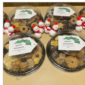
Cookies and snowman crafts that were donated