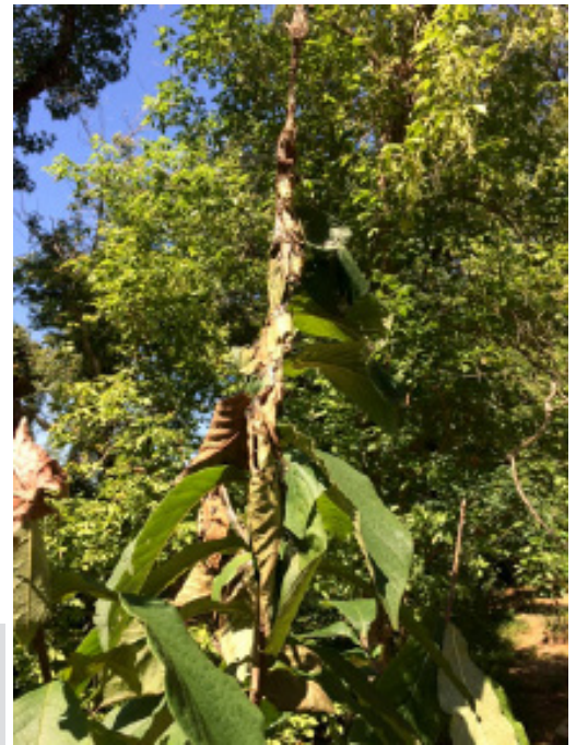
Look inside folded leaves, like on this paw paw, to see if caterpillar larvae are present