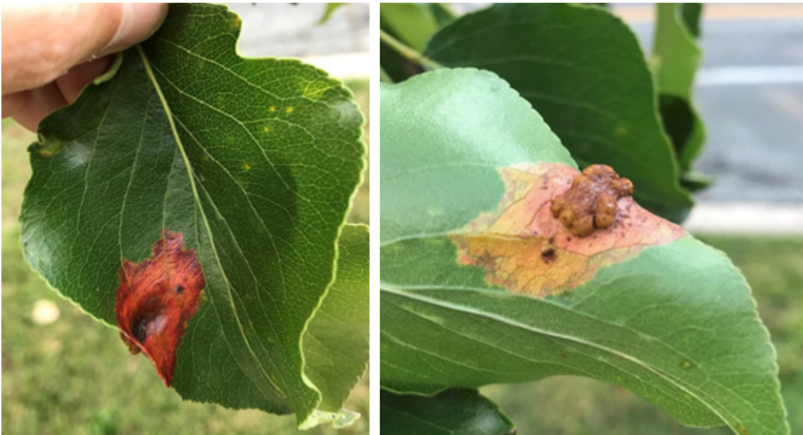
Pear Trellis rust on ornamental pear. Left – rust lesion on upper leaf surface. Right – lower surface of lesion showing immature, rounded aecia.

You may notice reddish leaf lesions on ornamental pears at this time of year. If you look carefully, you can see “bumps” on the underside of these lesions. These are the symptoms and developing aecia (spore structures) of pear trellis rust, Gymnosporangium sabinae . Like other Gymnosporangium rusts (cedar apple rust and cedar quince rust for example), this rust fungus infects junipers, causing small galls on twigs which ooze orange masses of teliospores in the spring and early summer. These spores are splashed via wind-driven rain to cause infections on leaves of both fruiting pears and ornamental pears. Unlike related Gymnosporangium rusts, however, the leaf lesions may go unnoticed until late summer, when they enlarge, become bright red in color and rounded aecial structures develop on the lower lesion surface. Spores released from these structures in late summer and fall will infect current-year juniper shoots, completing the cycle. In our area, this disease usually does not have a major impact on the health of ornamental pears (some would say “unfortunately”!). However, seeing this disease gives us another chance to contemplate the amazing complexity of fungi and their lifestyles!