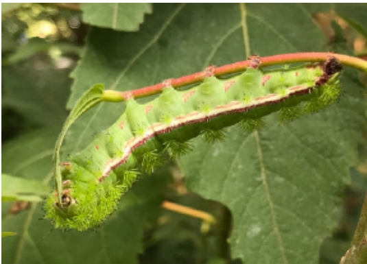
This Io moth caterpillar that is feeding on ‘Lord Baltimore’ hibiscus has stinging hairs

This week, Nancy Woods, MNCPPC, sent in pictures from plant material in Bethesda. This species is another spined caterpillar with urticating spines. It is called the Io moth larvae, Automeris io (Fabricius). When they first hatch, they are reddish brown colored, but as we move through September they are bright green with a stripe running down the side with large, mainly green colored spines. The body is virtually surrounded with scoli bearing green with black-tipped venomous spines. Treat this caterpillar with respect and observe it, but handle it with great care.