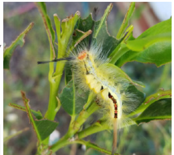
Whitemarked tussock moth caterpillars tend to be more common late in the season