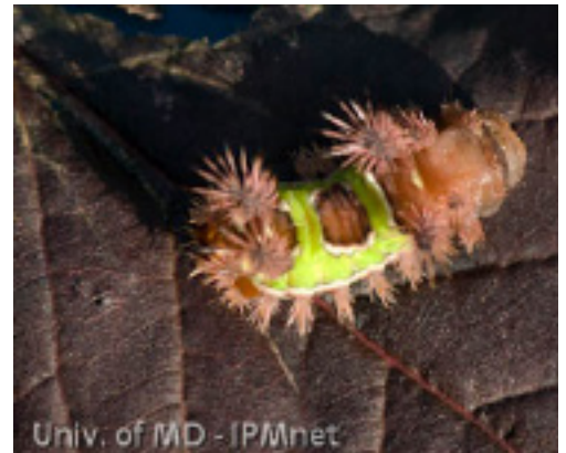
This color saddleback caterpillar also has painful stinging hairs