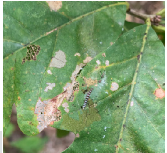
Leaffolder caterpillar activity continues this week on oak

Heather Zindash, IPM Scout, is finding a leaffolder on oak this week. She reported that she found the tell-tale long silk threads that look like stitches, holding the leaves together and noted that they were not rolled like the ones we have been seeing on Cercis this summer.