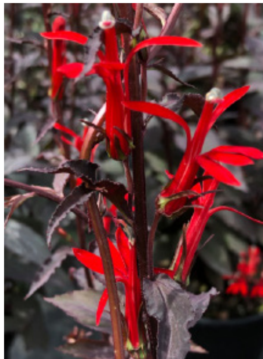
The bright red flowers of Lobelia cardinalis 'Black Truffle' stands out against the almost black to maroon foliage