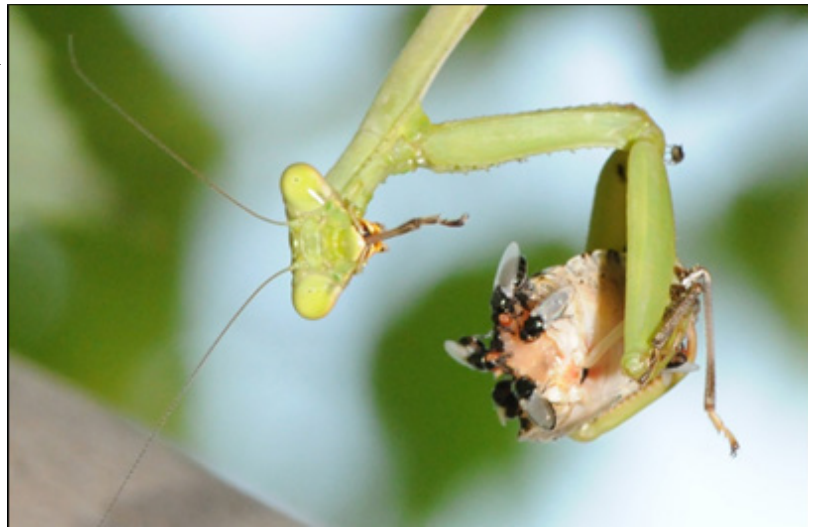
This European mantis finds brown marmorated stink bugs delicious.

locating prey. Mantises are generalist predators and eat many types of prey items. Young or small mantis eat small flies, crickets, and sometimes each other. Large mantis capture and eat other large insects that are pests of gardens. See the image of the European mantis eating a brown marmorated stink bug (head first). Watch this great video of a European mantis eating a large milkweed bug that it captured on my Asclepius plant. Sometimes, however, mantises eat beneficial insects including pollinators such as bees, butterflies, flies, beetles and, yes, there are accounts of them capturing and eating humming birds, in addition to lizards and frogs.