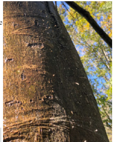
This American holly has a heavy infestation of ambrosia beetles

Late season ambrosia beetle activity continues this week. Spencer Ecker, Potomac Flower & Garden Design, found frass tubes from ambrosia beetle activity on an American holly in McLean on September 3. He noted that the frass tubes were about 10 ft up the tree.