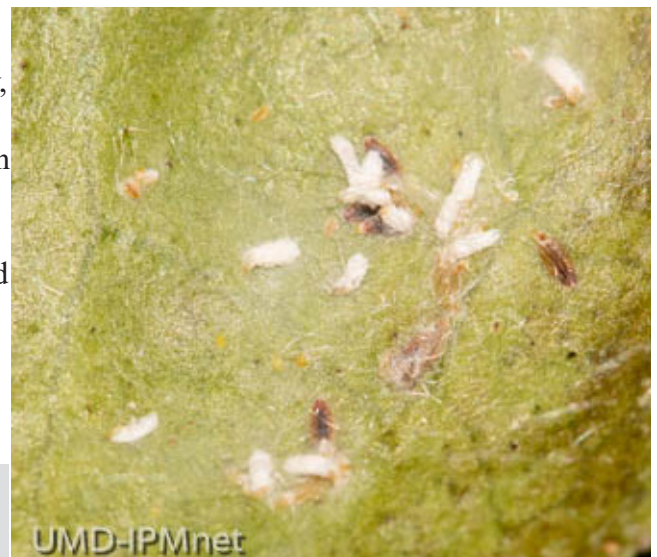
A few small yellow crawlers are present on this camellia leaf

Since this scale is a foliar feeder, systemic insecticides should work on it. Generally, we like to recommend the insect growth regulators such as Talus or Distance when a scale is in the crawler stage. These materials have worked well in our trials on armored and soft scale over the last 7 years.