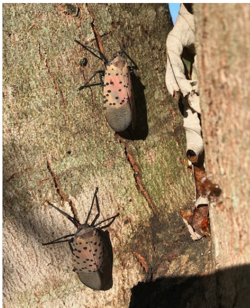
Spotted lanternfly adults were active in Cecil County on November 6, 2020

If you see eggs on trees, please report your finding to DontBug.MD@ maryland.gov.