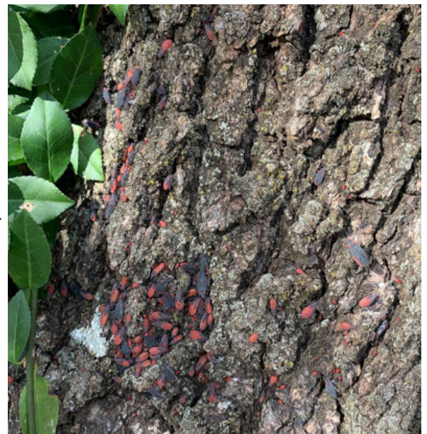
Red-shouldered bug nymphs are clustered at the base of a Sophora tree

Scott Diffenderfer, Mead Tree and Turf, sent in an interesting bug picture. It shows the nymph stage of Jadera haematoloma . This bug has at least three common names - red-shouldered bug, goldenrain-tree bug, or soapberry bug. The nymphs were found on a Sophora in Rockville. Much like their close relative, the boxelder bug, this bug overwinters as adults and may show up in your customers' houses this fall. The bug is flattened on the back and about 1/2 inch long and 1/3 inch wide. They are black, bluish-black or brownish-black with red coloring on the eyes, eye orbits, shoulders, and borders of the abdomen. The segment behind the eyes has three red lines running lengthwise. Adults and nymphs, during the growing season, feed by sucking the sap from seeds, flowers, leaves, and fruits of trees including plum, cherry, apple, peach, grape, chinaberry, western soapberry, ash, maple, and golden raintree. There is nothing you, or your customers, need to do for control other than use a portable vacuum to vac them up and dispose of them when they move into the house.