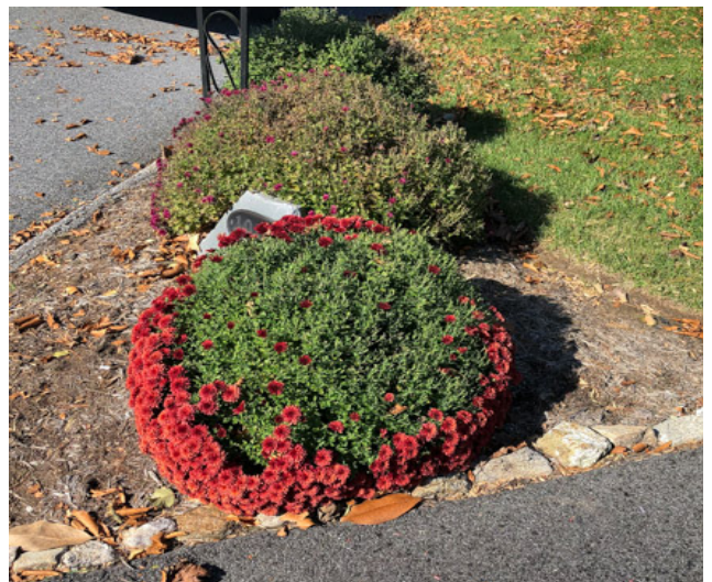
Deer have been feasting on these mums