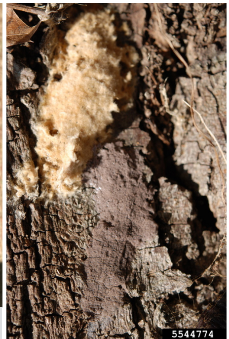
Look for egg masses on tree trunks at this time of year