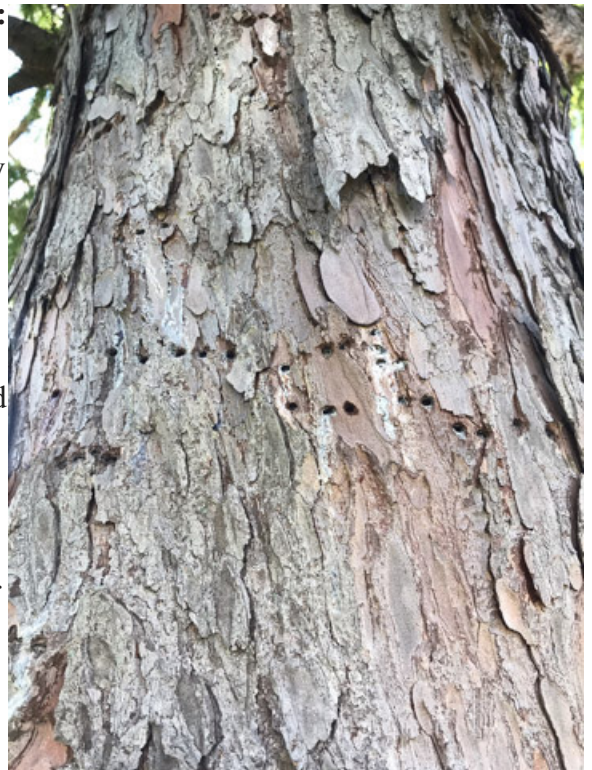
Yellow-bellied sapsucker damage on golden larch

What they are seeing is sapsucker damage to the larch. We reported back in mid-September that sapsuckers were active and have been hitting several species of trees this fall. Larch and Deodora cypress appear to be two of their favorites to peck on. If you look at the holes, besides being in somewhat of a line, they are funnel-shaped with the wide end on the outer part of the bark and the small center part of the hole.