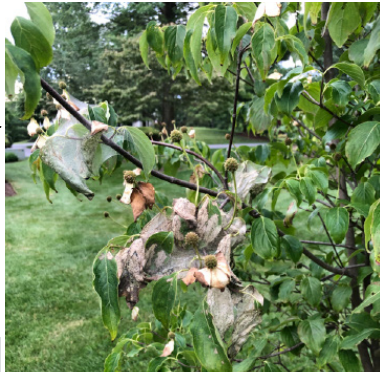
The first generation of fall webworms are active now

Control: If possible, prune out webbed terminals. Bt, horticultural oil, or insecticidal soap can be used for early instars. There are many predators and parasites that help keep this native pest below damaging levels.