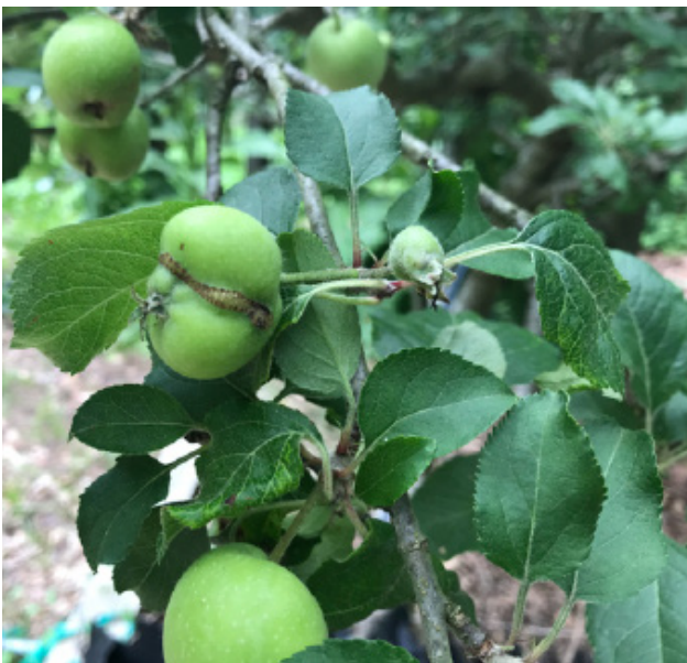
Tiered leaf roller damage on apples