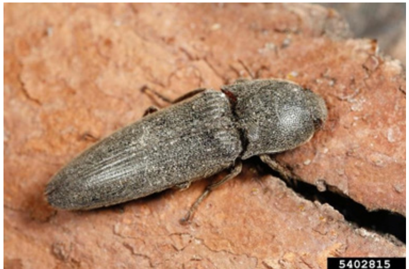
A click beetle adult demonstrating the typical shape of these beetles.

If you spend some time at night looking at plants and the bugs moving around on them you are likely to come across a click beetle. I saw my first of the season the other night on the flower head of my monarda plant. Click beetles are in the Elateridae family and there are over 9,000 species worldwide, and almost 1,000 of those species occur in North America. Other common names are elaters, snapping beetles, spring beetles, and skipjacks. These names come from an unusual and sometimes startling defensive behavior these beetles have when threatened by predators. Click beetle adults have tough bodies (hard exoskeletons) and they have a “clicking mechanism”. Click beetles have an amazing “spine” on the underside of their body (the prosternum which is the first section of the thorax) that snaps or fits into a matching