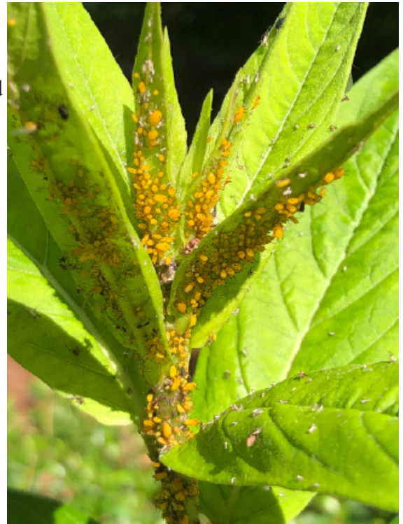
Oleander aphids are a constant problem on milkweed plants

Bill Miller, The Azalea Works, found a high population of oleander aphids on milkweed this week. These aphids are very difficult to control. Predators and parasitoids feed on them, but they seldom seem to be in high enough numbers to decrease these oleander aphid populations. Connie Bowers, Garden Makeover Company, found a different species of aphids on hellebores in two different landscapes this week. Aphids on hellebores have been very active this spring.