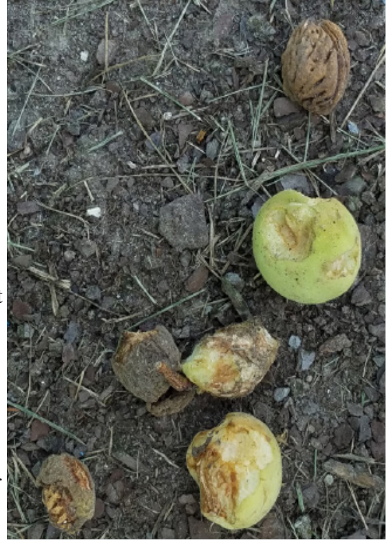
Squirrels have been feeding on these peaches

Several caterpillars will be active feeding on the skin of young apples, causing a scarring of the fruit as we move into July and August. Applications of spinosad sold under the name or Delegate or SpinoCor) will help keep the caterpillar damage limited.