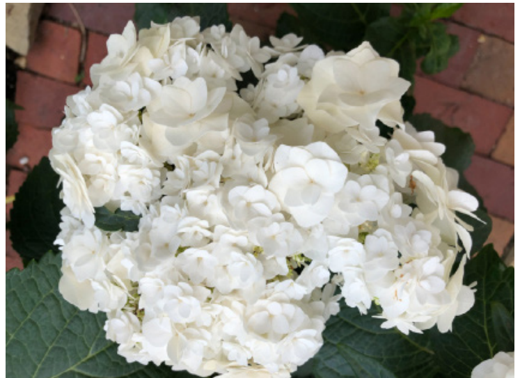
Hydrangea macrophylla Double Delights™ ‘Wedding Gown’ produces pure white, double flowers