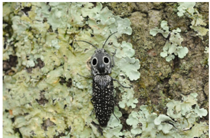
Eyed click beetles, also known as eyed elaters, are named so because of the false eye spots. They are one of the larger click beetles, which are almost 2” as adults. These “eyes” likely make the beetle appear larger and more intimidating to potential predators.

When you see a click beetle, pick it up and examine it closely. But be ready for it to “click” and jump suddenly in its attempt to scare off a potential threat. Catching click beetles and watching them click is a great activity to use to teach kids about biology and ecology.