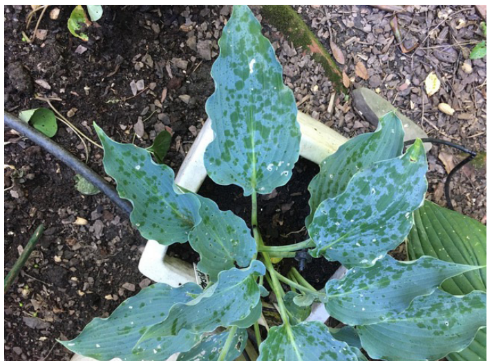
This hosta was farther away from the treated area than the other plants