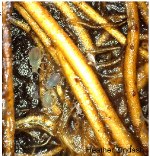
Root aphids infesting Juncus effusus

The third project is a Southeast and Northeast joint project to look at the life cycle, damage, and control options for redheaded flea beetles. The University of Georgia is leading the project, and I am involved from University of Maryland Extension. I will be asking some of the Maryland nursery owners to fill out an online survey so our working group can see the actual extent of this problem in container nursery products.