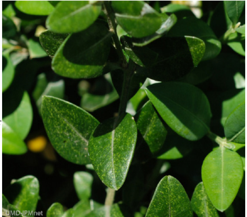
UMD-IPMnet Stippling on foliage is a sign of spider mite feeding

If still active, Sanmite is a good miticide. I recommend Hexygon (mite growth regulator) when you can catch a population with many immature stages which we are past at this point in the season. Horticultural oil will work, but use 0.5 to the most 1% rates at this time of year.