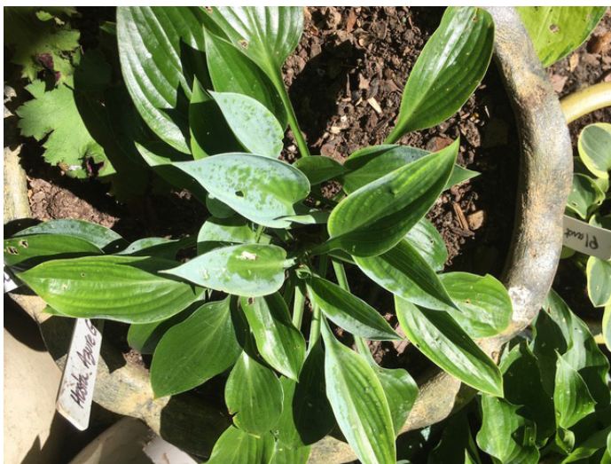
Hosta 'Azure' will little blue color left on foliage after an acephate and oil treatment