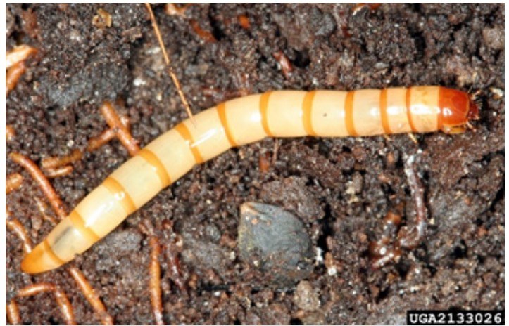
Click beetle larvae are also known as a wireworms and are active in the soil.

Click beetle adults are elongate in shape and usually less than 2 centimeters in length (see image). Most have dull colors and patterns and can fly. Adult click beetles can be found on plants, on the ground, in decaying wood, and on or under the bark of trees. Most adults are nocturnal (often seen at lights near buildings) and are plant feeders, feeding on nectar, pollen, and flowers, although they seldom cause damage to plants. Some species, however, are predacious as adults and feed on aphids and other soft-bodied insects. The adults and larvae of some species are luminescent (they glow). The larvae of click beetles are called wireworms and are found in soil. The larvae are slender, elongate (~1-1.5”), and have somewhat hard exoskeletons and 3 pairs of legs on their thorax (see image). Many species are saprophytes feeding on dead insects and organisms in the soil, while other species of wireworms are serious agricultural pests of potatoes and strawberries. There are however, click beetle species such as the eyed elater where the larvae are predacious and actively hunt in the soil for insects, insect eggs, and small invertebrates to consume.