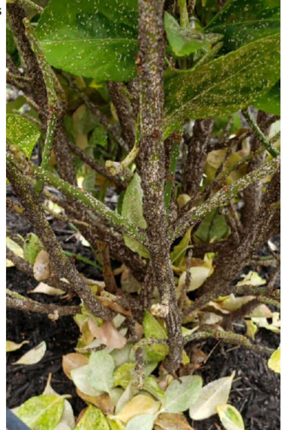
Male euonymus scale are coating this euonymus plant

Euonymus scale is a problem that can show up on pachysandra and boxwood. The preferred hosts are euonymus species, but if you have an infested plant in the landscape it can easily spread to these other species of plants.