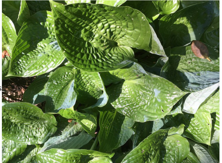
Hosta 'Glorious Silver Bay' with blue color gone after a nearby acephate and oil treatment

We have known for years that horticultural oils take out the waxy layer on blue spruce turning the foliage green. The hosta damage is something new to Paul and he hoped someone else would learn from his mistake. Do not apply horticultural oil on many species of blue color foliage plants.