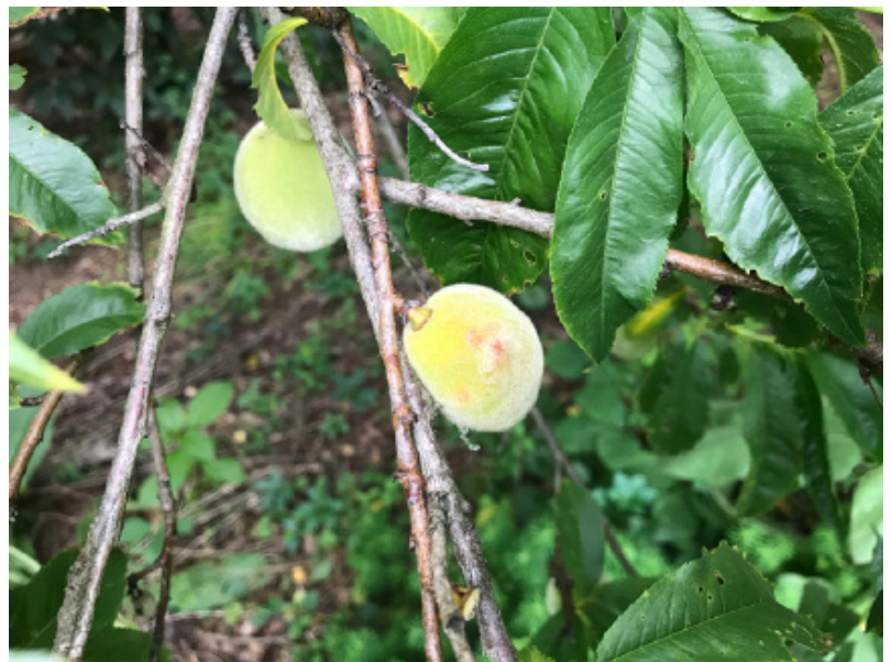
Oriental fruit moth damage on peaches