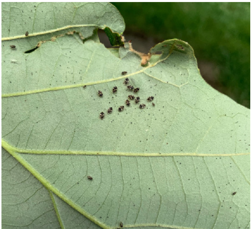
If you see stippling damage on the top side of oak leaves, look underneath for lace bugs

Heather Zindash, IPM Scout, found lace bug feeding causing stippling damage on a newly planted Quercus bicolor in a residential landscape. Heather noted that there were multiple stages present, as well as fecal spots on the leaves. There are several generations of this lace bug each season. Usually, these lace bugs do not cause significant damage to warrant control in the landscape. Look to see if predators such as lace wings are present.