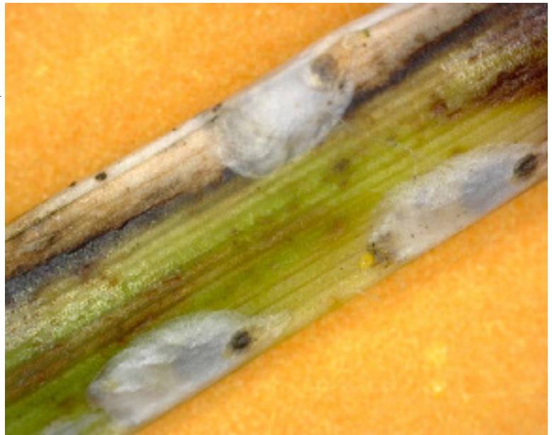
A scale, Duplachionaspis divergens , was found infesting Acorus gramineus 'Variegatus' being grown in a hoop house Heather Zindash, IPM Scout

If you find this scale on ornamental grasses, please send in a sample to me at CMREC, 11975 Homewood Road Ellicott City, MD.