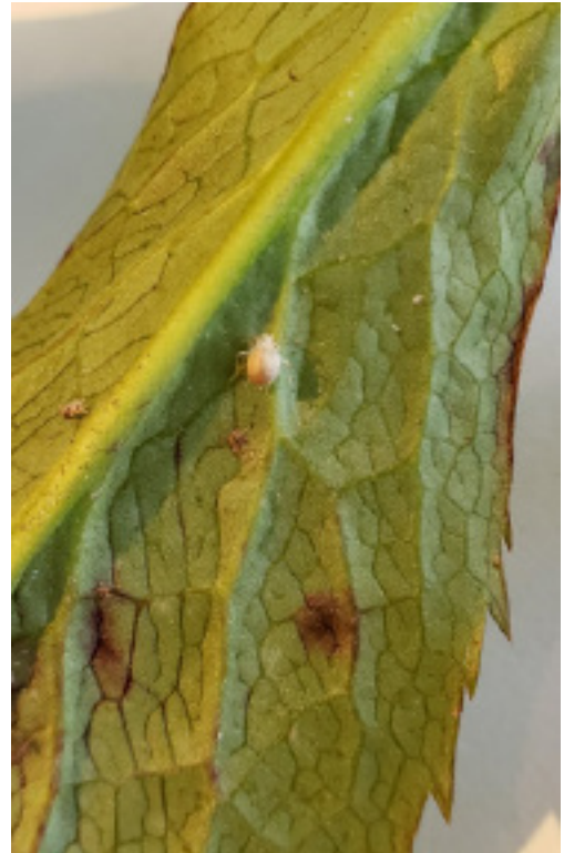
Aphids are already active on hellebores (above); look for aphid mummies indicating parasitoid activity (right)